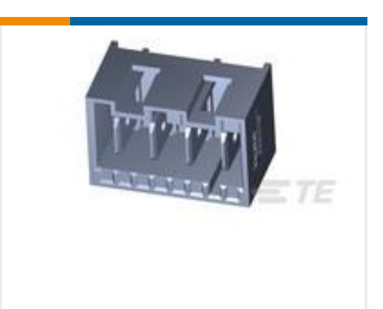
TE Part #521383-4 ASSY DIN VERT RAST5 HEADER04-A