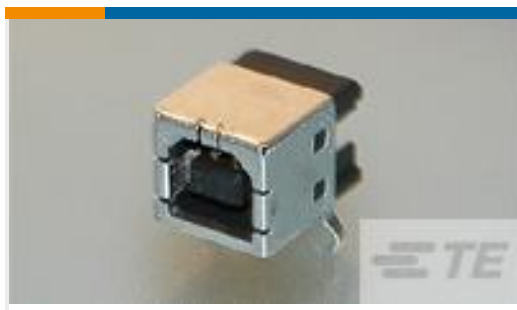
TE Part #292304-1 STD USB TYPE B, R/A, T/H