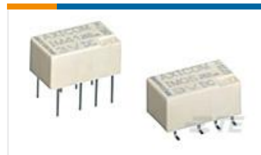
TE Part #1-1462037-4 IM03GR=IM RELAY 140mW 5V