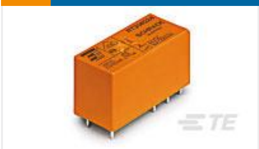
TE Part #7-1393243-8 RT424615