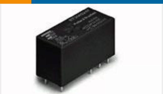
TE Part #2-1393237-7 RT334024F