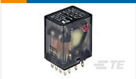
TE Part #5-1393122-7 KHAU-17D12-24=KH