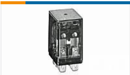
TE Part #5-1393144-4 K10P-11D15-110=K10/K20