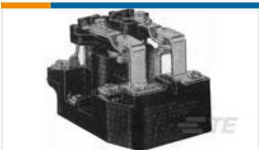
TE Part #1-1393127-6 PRD-11AH0-120=PRD