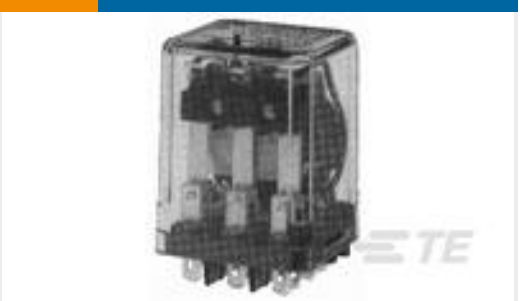
TE Part #9-1393117-6 KUP-14A45-240=KU