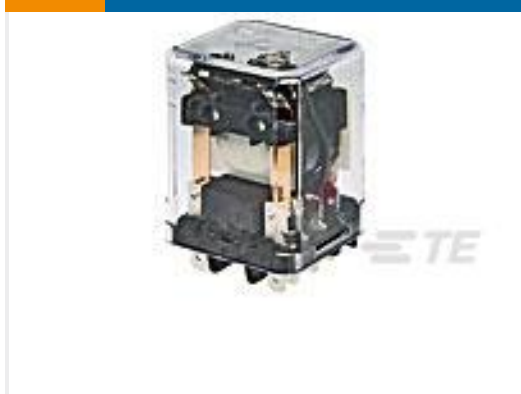
TE Part #9-1393113-9 KUEP-3D15-125=KU