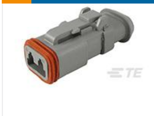
TE Part #DT06-2S-CE04 PLG, 2P, GRY, E, XCAP