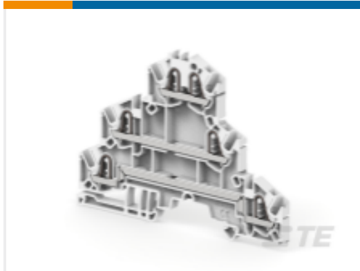
TE Part #1SNK705510R0000 ZK2.5-T3