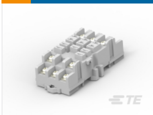
TE Part #2-1419106-5 27E893=SOCKET,KU,11,QC,POLY,NA-