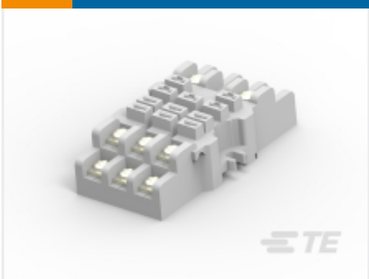
TE Part #1393143-5 27E121=SOCKET,KUP,11,SCW,PLE