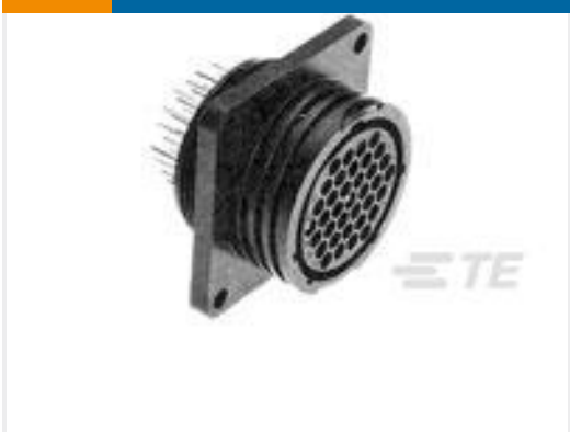
TE Part #2-208224-1 CPC RECPT ASSEMBLY SIZE 23-37