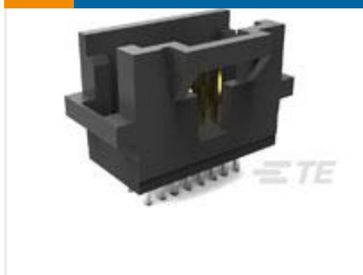
TE Part #5-104068-4 40 SYSTEM 50 HDR DRST SHRD