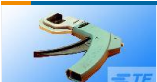
TE Part #58247-1 MTA 156 CRIMP HEAD REPAIR DISCRETE