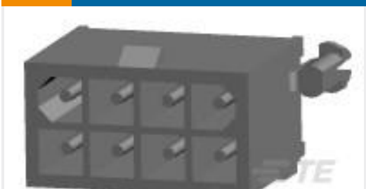
TE Part #1-794065-0 08P MINI UMNL HDR W/DH SN