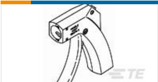
TE Part #58074-1 MTA 50/100/156 MANUAL TOOL FRAME