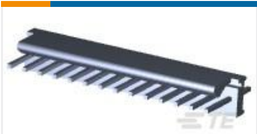
TE Part #1-640456-4 14P MTA100 HDR ASSY F/L SQ STR