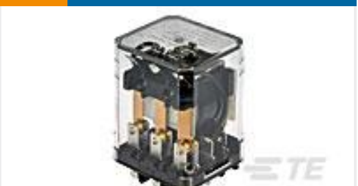
TE Part #7-1393117-9 KUP-14A15-24=KU