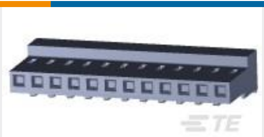
TE Part #4-640431-2 12P MTA156 CONN ASSY 18AWG ORA