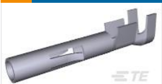
TE Part #350550-1 UMNL SOK 20-14 PTPBR L/P