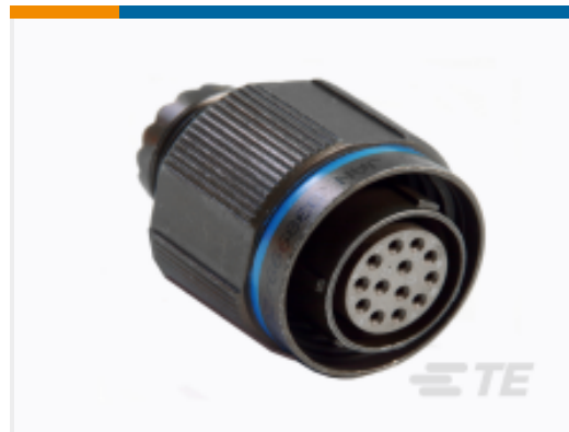
TE Part #YDTS26F17-35PAV001 PLUG ASSY