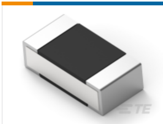
TE Part #5-2176307-9 RP 1E 0.1W 49K9 0.1% 25PPM 5K RL