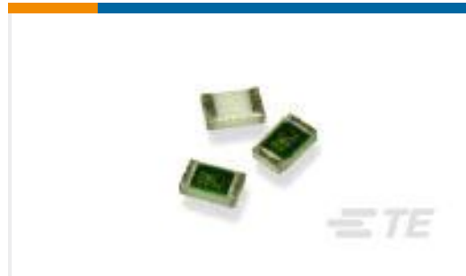
TE Part #1879417-4 CPF0603 680K 0.1% 25PPM 5K RL