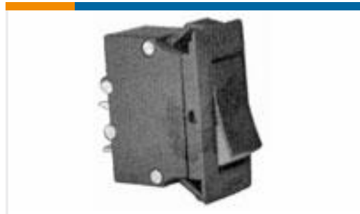
TE Part #1423673-5 W51-A121B1-10=CKTBKR,THERM,ROC