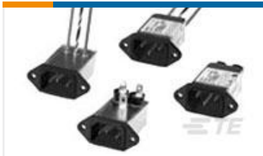
TE Part #6609015-7 10EF1F=F7423 S0