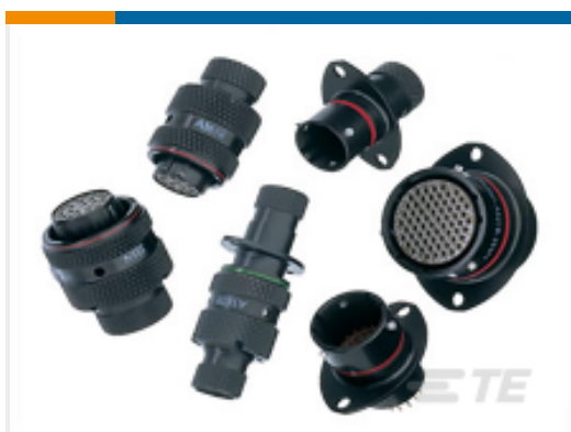
TE Part #AS620-16PN PLUG BOOT TERMIN TYPE 6