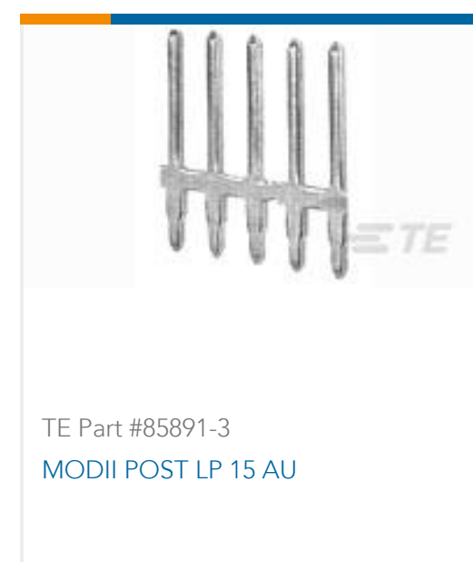
TE Part #85891-3 MODII POST LP 15 AU