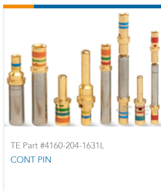
TE Part #4160-204-1631L CONT PIN