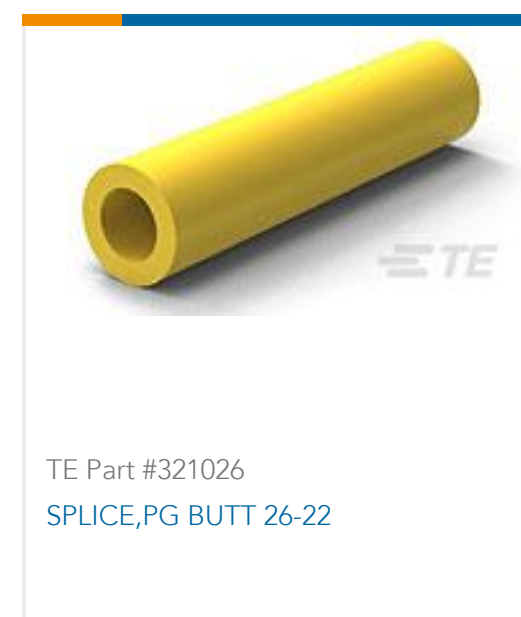
TE Part #321026 SPLICE,PG BUTT 26-22