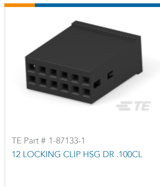
TE Part # 1-87133-1 12 LOCKING CLIP HSG DR .100CL