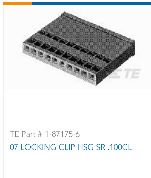
TE Part # 1-87175-6 07 LOCKING CLIP HSG SR .100CL