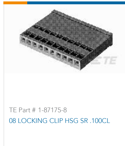
TE Part # 1-87175-8 08 LOCKING CLIP HSG SR .100CL