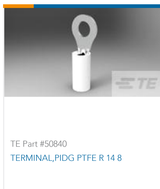
TE Part #50840 TERMINAL,PIDG PTFE R 14 8