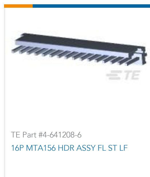
TE Part #4-641208-6 16P MTA156 HDR ASSY FL ST LF