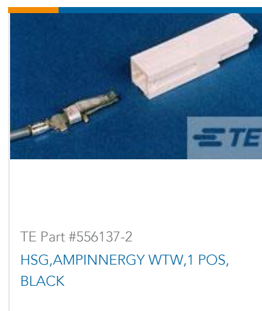
TE Part #556137-2 HSG,AMPINNERGY WTW,1 POS, BLACK