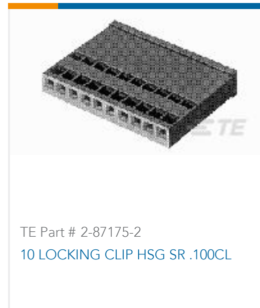
TE Part # 2-87175-2 10 LOCKING CLIP HSG SR .100CL