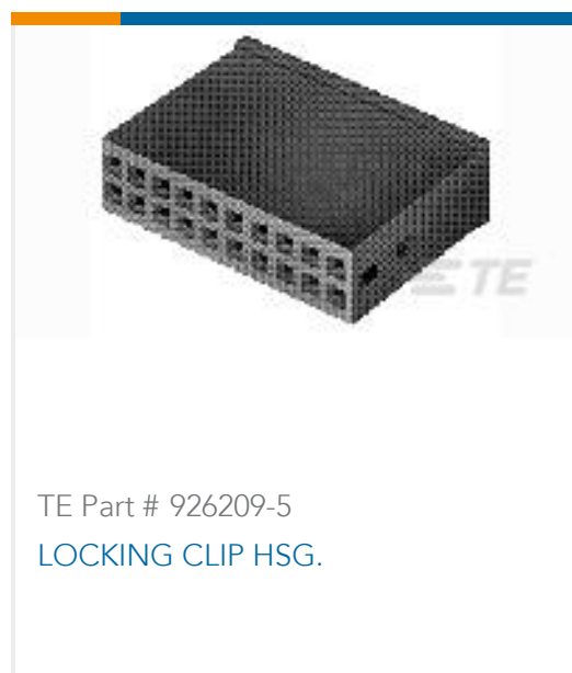
TE Part # 926209-5 LOCKING CLIP HSG.