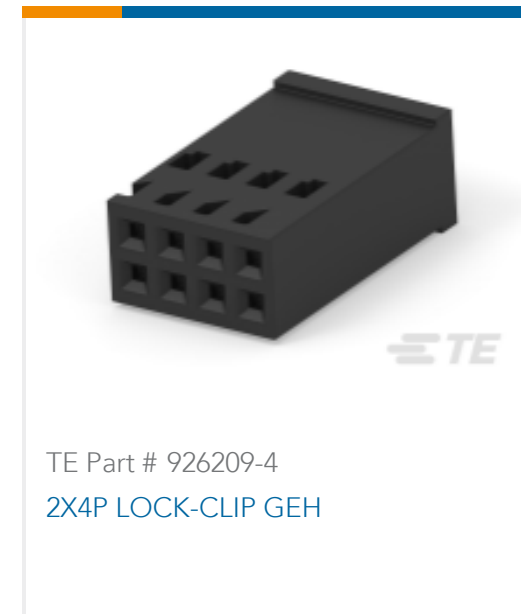
TE Part # 926209-4 2X4P LOCK-CLIP GEH