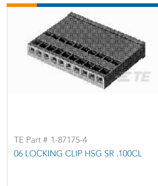
TE Part # 1-87175-4 06 LOCKING CLIP HSG SR .100CL