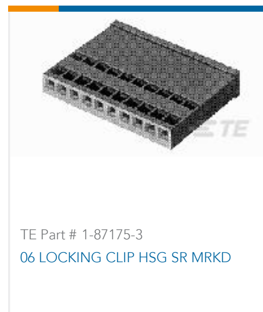
TE Part # 1-87175-3 06 LOCKING CLIP HSG SR MRKD