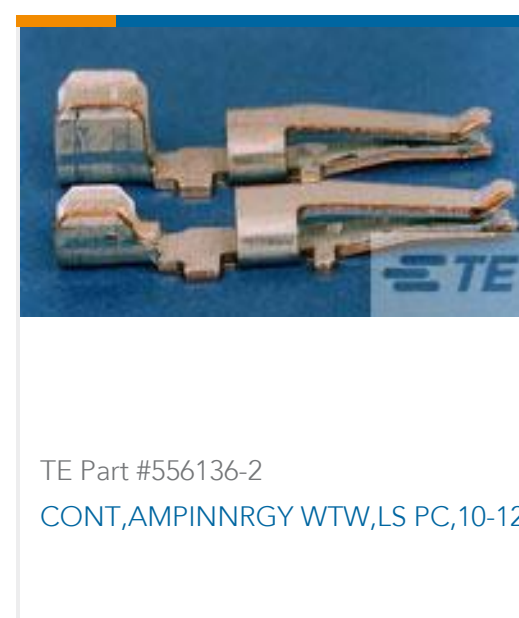
TE Part #556136-2 CONT,AMPINNERGY WTW,LS PC,10-12