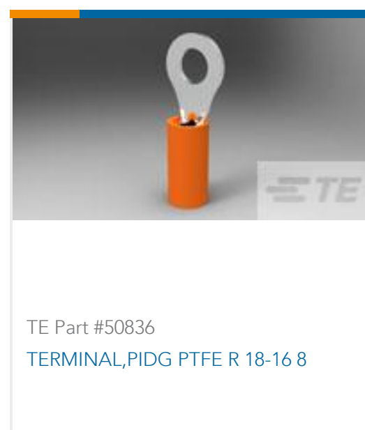
TE Part #50836 TERMINAL,PIDG PTFE R 18-16 8