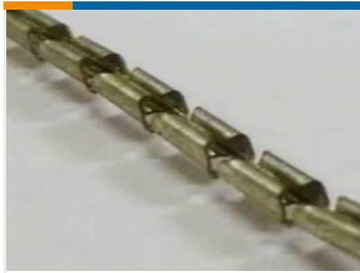
TE Part # 2-330854-6 MAXI T.P. CLIP