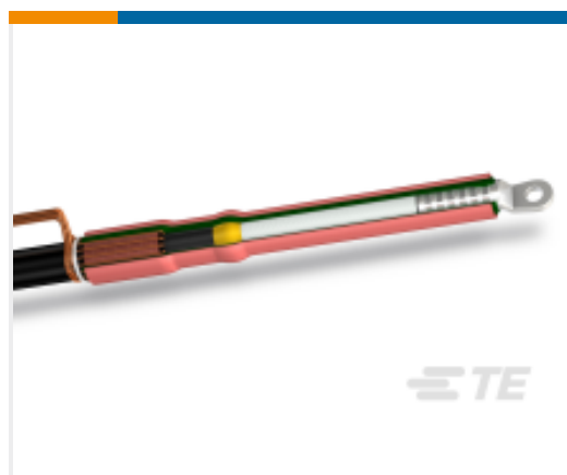
TE Part #000877-005 IXSU-F5151