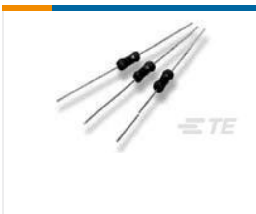
TE Part #3-1625890-8 2W SM M/OX 5% 2K2