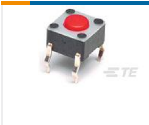
TE Part #2-1825910-7 FSM14JH=6MM TACT SWITCH, HIGH TEMP