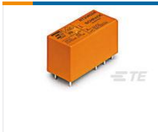
TE Part #9-1393239-8 RT314024