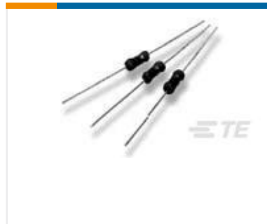
TE Part #5-1625885-3 1W SM M/OX 5% 2K2