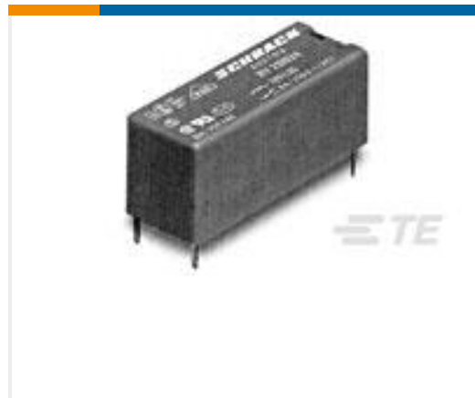
TE Part #4-1393224-9 RY211024