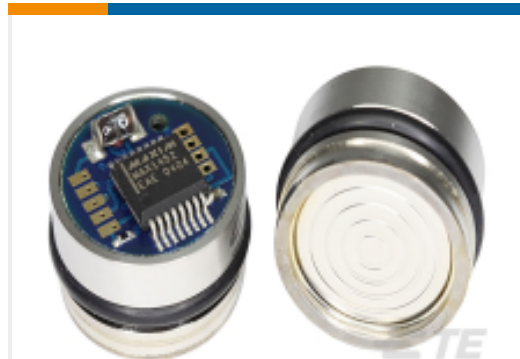
TE Part #86A3R-000000-100PG 100 PSIG ANALOG PRESSURE SENSOR