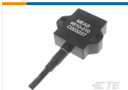
TE Part #20007019-00 4610-100-120-D