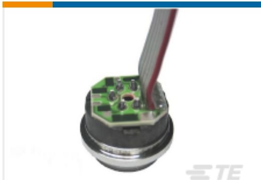
TE Part #85-100A-8R 100 PSIA 1/8-27 NPT CABLE CONN SENSOR