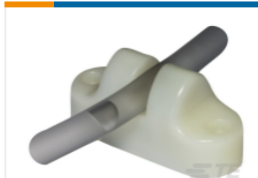
TE Part #10217784-00 ABD,AD-101, COMPACT ASSY, 4MM