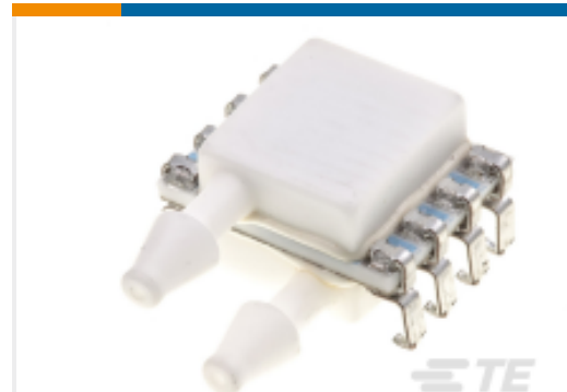
TE Part #4525DO-DS3AS015GP PRESS XDCR,DIGITAL,PSI RANGE