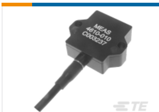
TE Part #20007013-00 4610-002-120-D