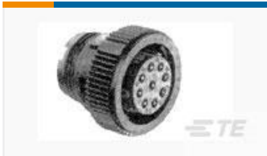
TE Part #205839-3 CPC PLUG ASSEMBLY SIZE 17-28