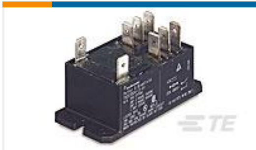
TE Part #1-1393212-7 T92S7D22-24