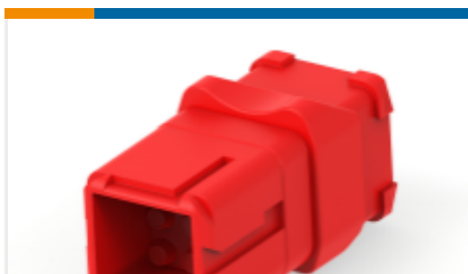
TE Part #D369-R99-BS0 Rectangular Connectors, 9 Way Receptacle