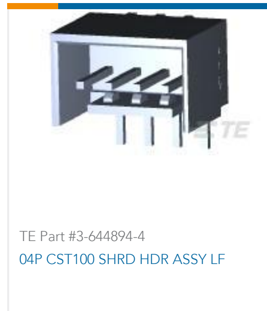
TE Part #3-644894-4 04P CST100 SHRD HDR ASSY LF