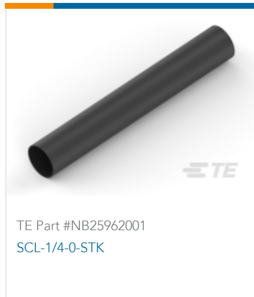
TE Part #NB25962001 SCL-1/4-0-STK