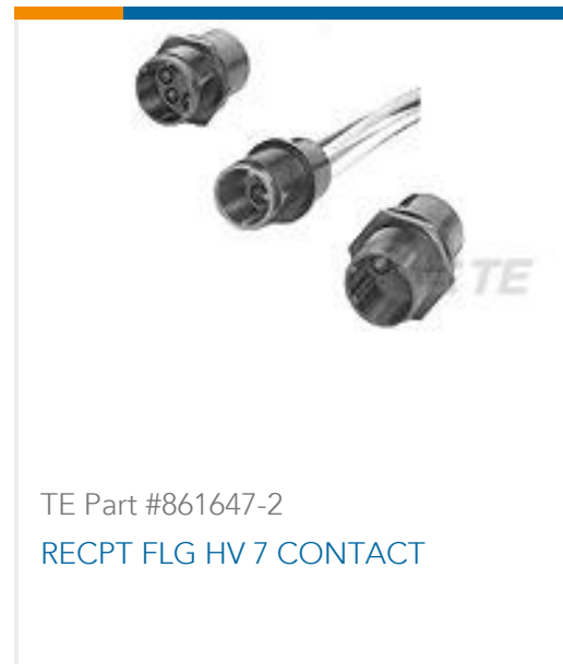
TE Part #861647-2 RECPT FLG HV 7 CONTACT