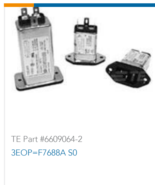
TE Part #6609064-2 3EOP=F7688A S0