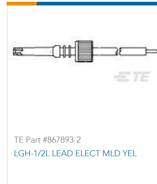
TE Part #867893-2 LGH-1/2L LEAD ELECT MLD YEL