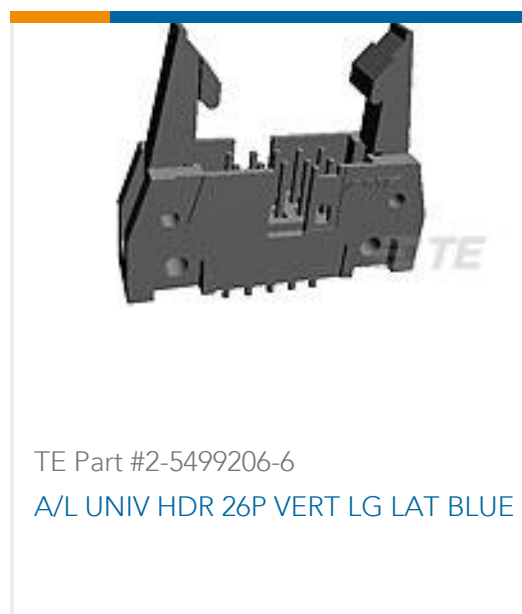
TE Part #2-5499206-6 A/L UNIV HDR 26P VERT LG LAT BLUE