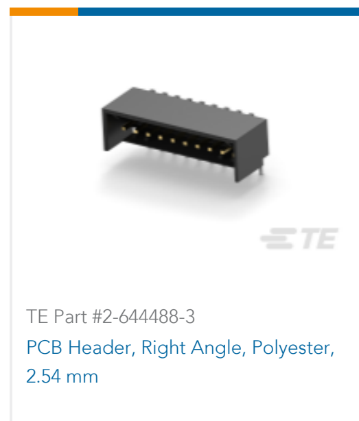
TE Part #2-644488-3 PCB Header, Right Angle, Polyester, 2.54 mm