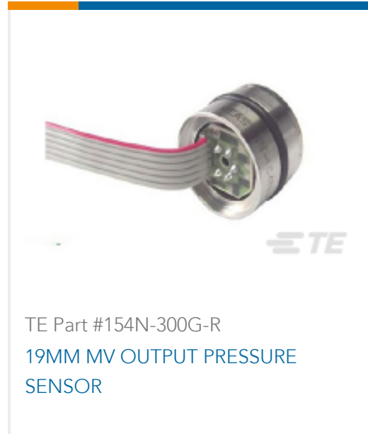
TE Part #154N-300G-R 19MM MV OUTPUT PRESSURE SENSOR