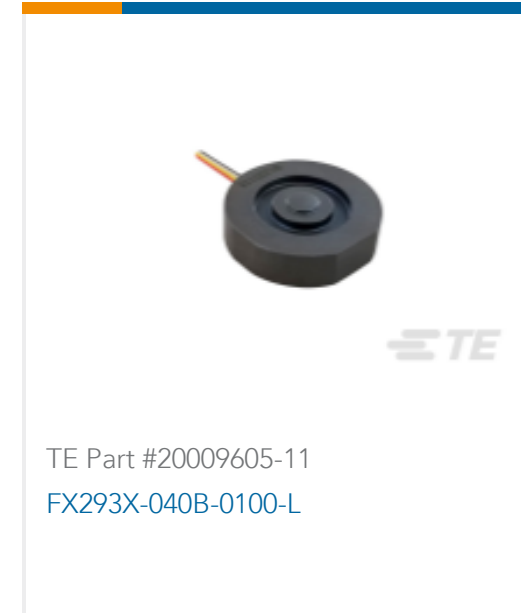
TE Part #20009605-11 FX293X-040B-0100-L