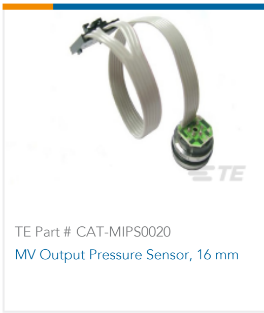
TE Part # CAT-MIPS0020 MV Output Pressure Sensor, 16 mm