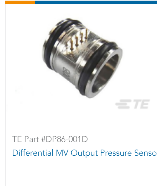
TE Part #DP86-001D Differential MV Output Pressure Sensor