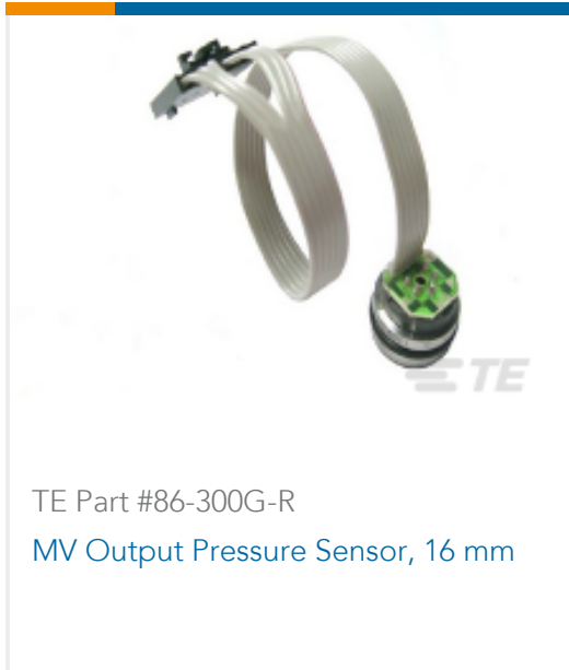
TE Part #86-300G-R MV Output Pressure Sensor, 16 mm