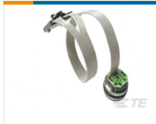
TE Part #86-015G-R 15 PSIG RIBBON CABLE MV PRESSURE SENSOR