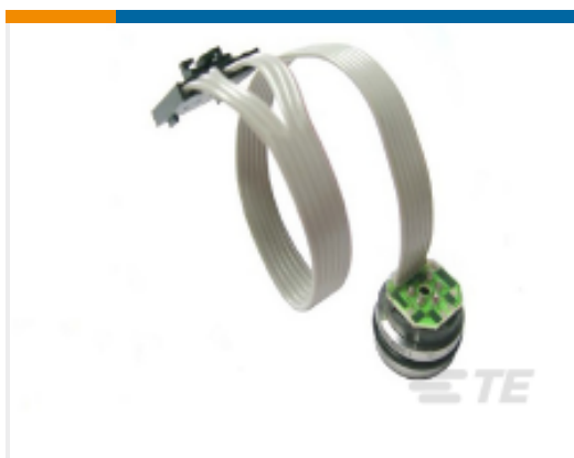
TE Part #86-500G-R 500 PSIG RIBBON CABLE MV PRESSURE SENSOR