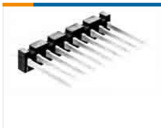
TE Part #1-85829-5 15 MODI HDR SRST .156CL