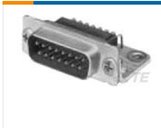
TE Part #5747022-2 25 PLUG RA/MS STD (SL)