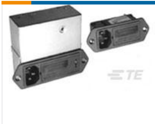
TE Part #1-6609130-5 5EHM4S=F8117