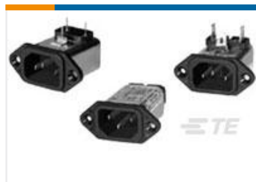
TE Part #1-6609001-0 10EEB1=F7533 S0