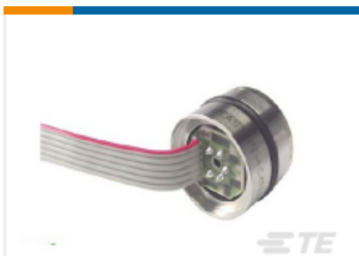
TE Part #154N-001G-R 1 PSIG RIBBON CABLE MV PRESSURE SENSOR