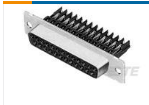
TE Part #1-745495-8 25 HDE MS RCPT, 22-26, LEAD FREE