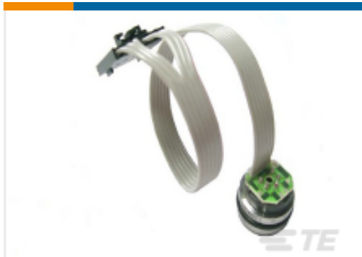
TE Part #86-300A-C MV Output Pressure Sensor, 16 mm