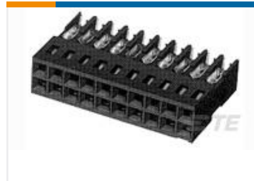
TE Part #5-102694-1 06 ampmodu mt assy dr.sn