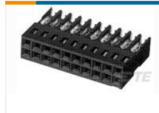
TE Part #5-102694-4 12 ampmodu mt assy dr.sn