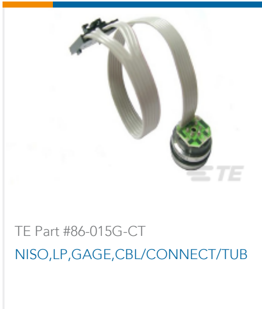
TE Part #86-015G-CT NISO,LP,GAGE,CBL/CONNECT/TUB