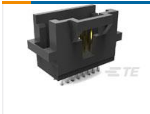
TE Part #5-104068-4 40 SYSTEM 50 HDR DRST SHRD