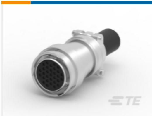
TE Part #HD36-24-31SE-059 PLG,31P,AL,E, CBL CLMP BT, DRAIN, 16,S,MC