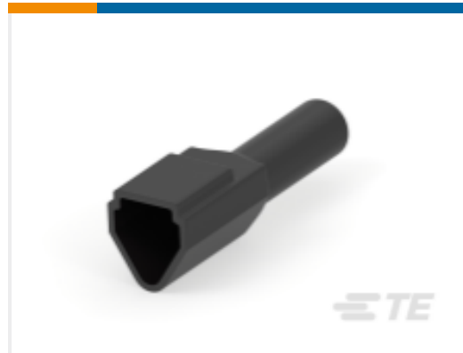
TE Part #DT3P-BT-BK BOOT, 3P, REC, ST, BLK