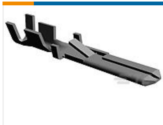
TE Part #928930-1 FF 110 TAB 0.5-1 MM2 .080 F SSP CUZN30