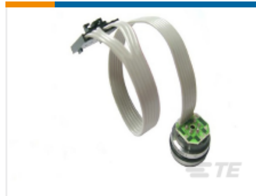
TE Part #86-030G-R MV Output Pressure Sensor, 16 mm