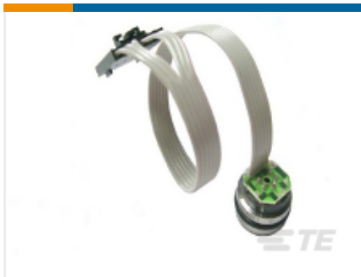
TE Part #86-500G-R 500 PSIG RIBBON CABLE MV PRESSURE SENSOR