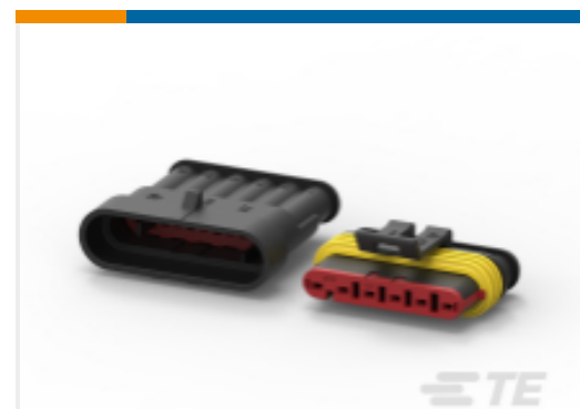
TE Part #282080-1 AMP SUPERSEAL 1.5MM, CONNECTOR HOUSING