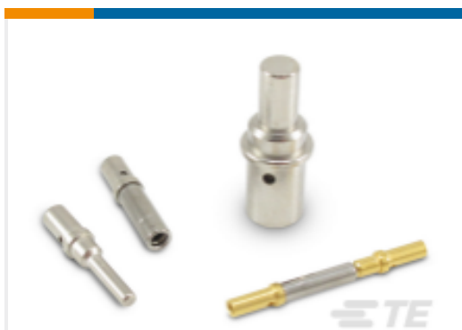
TE Part #0462-201-16141 DEUTSCH Solid Contacts