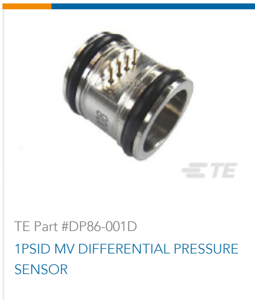
TE Part #DP86-001D 1PSID MV DIFFERENTIAL PRESSURE SENSOR