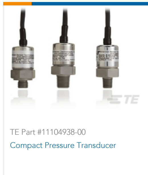
TE Part #11104938-00 Compact Pressure Transducer