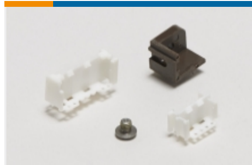
PCB Connector Mounting(3)