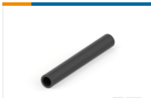
TE Part #115607J001 versafit-V2 Heat shrink Tubing