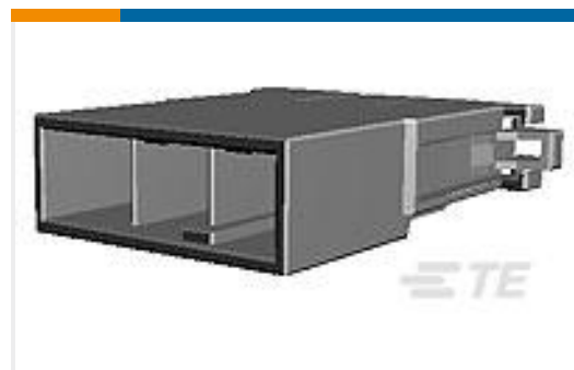
TE Part #1-2040021-4 DYNAMIC D-5200S DUMMY REC HSG 4P CUTTING