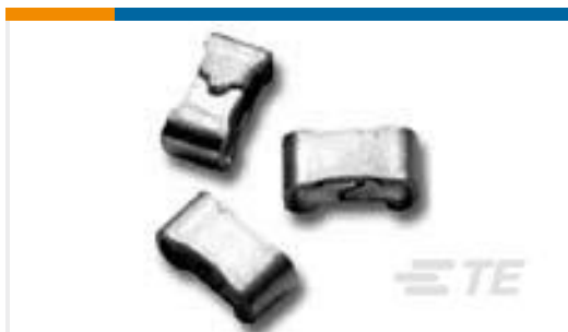
TE Part #1625854-3 0603 PROBE PAD