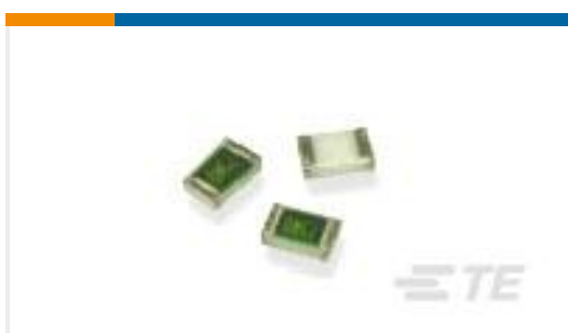
TE Part #7-2176092-3 RP 2A 0.25W 4K32 0.1% 25PPM 1K RL