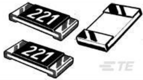
TE Part #2-2176230-6 3522 100R 5% 3W