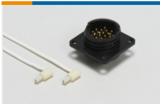
Circular Power Connectors(92)