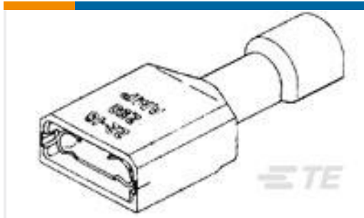
TE Part #7-520366-2 ULTRAFAST 110 ASSY REC 26-22 TPBR LP