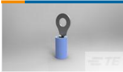
TE Part #320560 TERMINAL,PIDG R 16-14 8