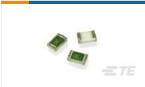
TE Part #1676427-2 RN 0805 75K 0.1% 10PPM 1KRL