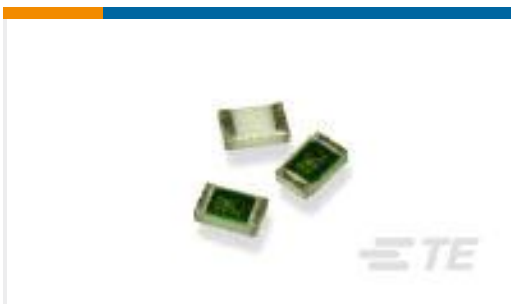
TE Part #8-1614884-4 CPF 0805 10K 0.1% 25PPM 1K RL