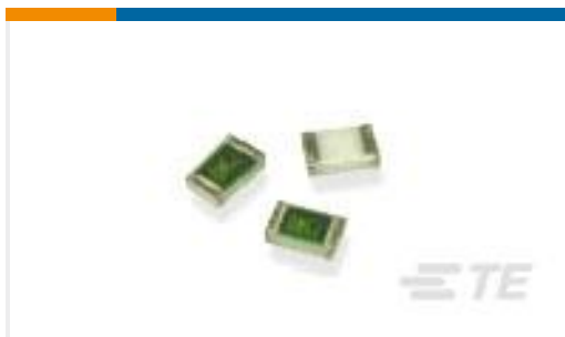
TE Part #1-2176093-0 RP 2A 0.25W 11K5 0.1% 25PPM 1K RL