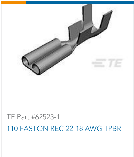
TE Part #62523-1 110 FASTON REC 22-18 AWG TPBR