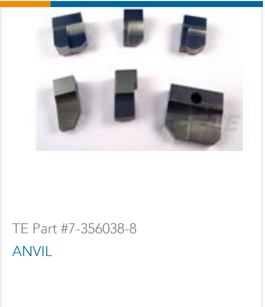
TE Part #7-356038-8 ANVIL