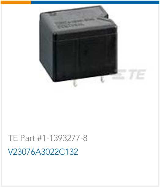
TE Part #1-1393277-8 V23076A3022C132