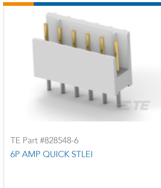
TE Part #828548-6 6P AMP QUICK STLEI