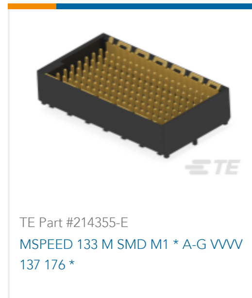
TE Part #214355-E MSPEED 133 M SMD M1 * A-G VVV 137 176 *