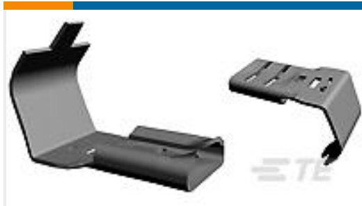
TE Part #61177-2 250 FASTON FLAG REC 18-12 AWG TPBR