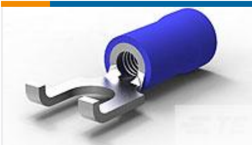
TE Part #53874-2 TERMINAL,PG SPD FLG 16-14 8