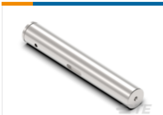
TE Part #551336-1 SHAFT-TRANSMISSION