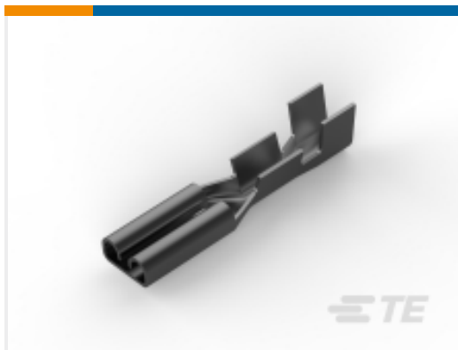
TE Part #60415-2 110 FASTON REC 22-18 AWG TPBR