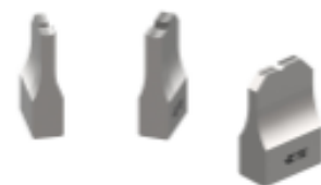
ANVIL REPRESENTATION ONLY