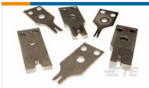
TE Part #1-456405-6 CRIMPER WIRE .080 F