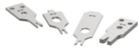
CRIMPER REPRESENTATION ONLY