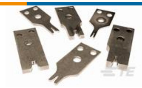
TE Part #3-2119784-7 CRIMPER, INSUL O PREMIUM