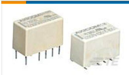
TE Part #1-1393788-6 V23079A1005B301