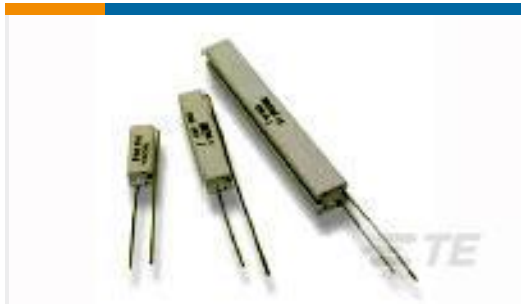
TE Part #1623729-4 BCHE 17 W 150R 5%