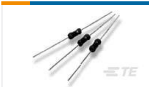
TE Part #4-1625886-1 1W SM M/OX 5% 820K