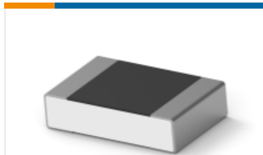
TE Part #3-2176379-5 RQ 0805 243R 0.1% 10PPM 5K RL