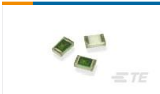
TE Part #9-2176091-4 RP 2A 0.25W 562R 0.1% 25PPM 1K RL