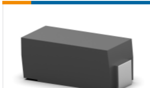
TE Part #4-2176459-4 SMW 7W 6R2 5% Taped