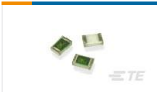
TE Part #8-2176091-3 RP 2A 0.25W 432R 0.1% 25PPM 1K RL