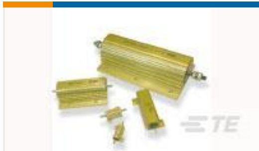
TE Part #4-1625999-7 HSC100 6R4 5%