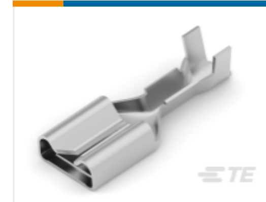
TE Part # 2238204-3 FASTON 250 STD REC STR 22-18TPBR