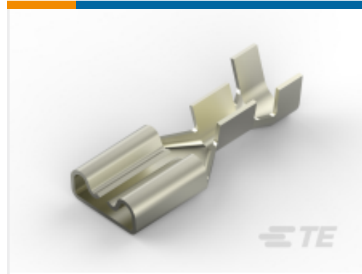
TE Part # 1742198-1 250 FASTON,REC.,18-14 AWG,NPST