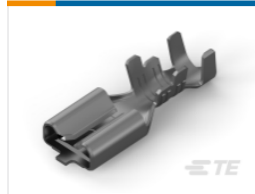
TE Part # 2238173-3 250 FASTON,REC.,22-12 AWG,TPBR