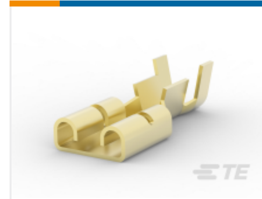
TE Part # 444335-1 250 FASTON REC 16-14 AWG BR