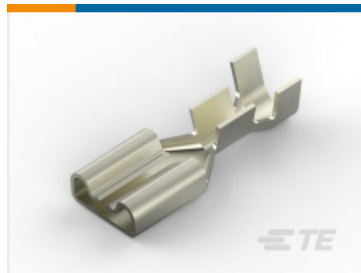
TE Part # 2238143-1 250 FASTON,REC.,22-18 AWG,NPST