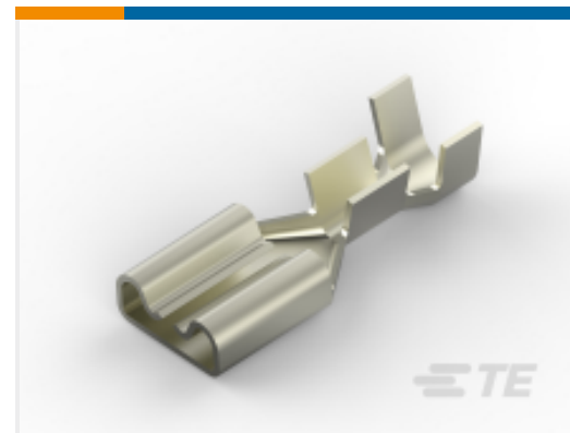
TE Part # 2238196-3 FASTON 250 STD REC STR 18-14TPBR