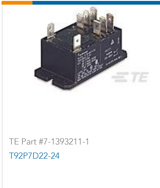
TE Part #7-1393211-1 T92P7D22-24