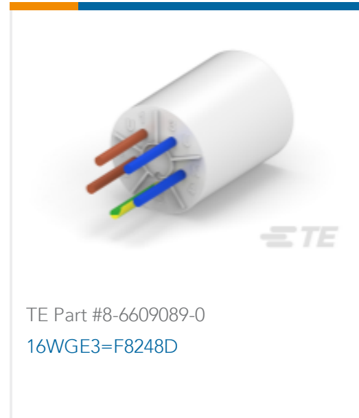
TE Part #8-6609089-0 16WGE3=F8248D