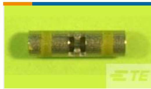
TE Part #680333-000 D-609-13