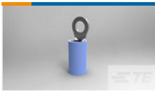
TE Part #2-320561-2 TERMINAL,PIDG R 16-14 6