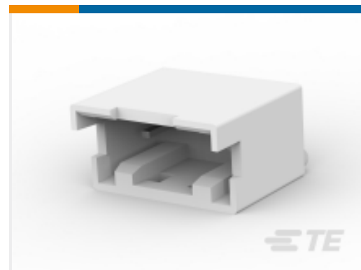
TE Part #2134303-1 GIC 2.5 HDR ASSY TIN VERSION 2/4P