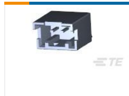
TE Part #2013523-1 GIC 2.5 HDR ASSY TIN VERSION 2/3P