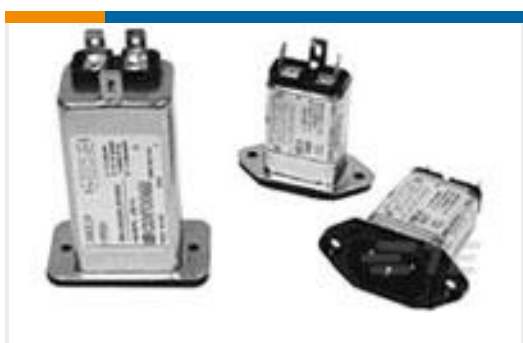
TE Part #6609006-6 3EEJ2=F8010 S0