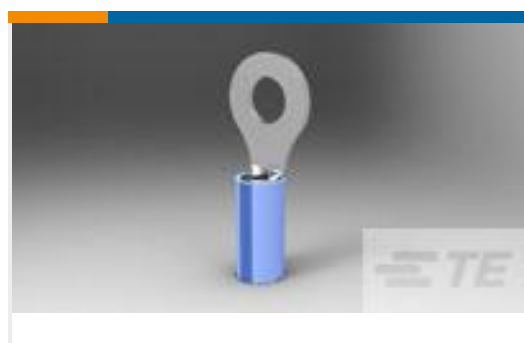
TE Part #2-320563-3 TERMINAL,PIDG R IR 16 1/4