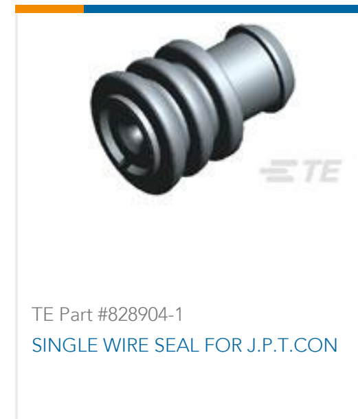
TE Part #828904-1 SINGLE WIRE SEAL FOR J.P.T.CON