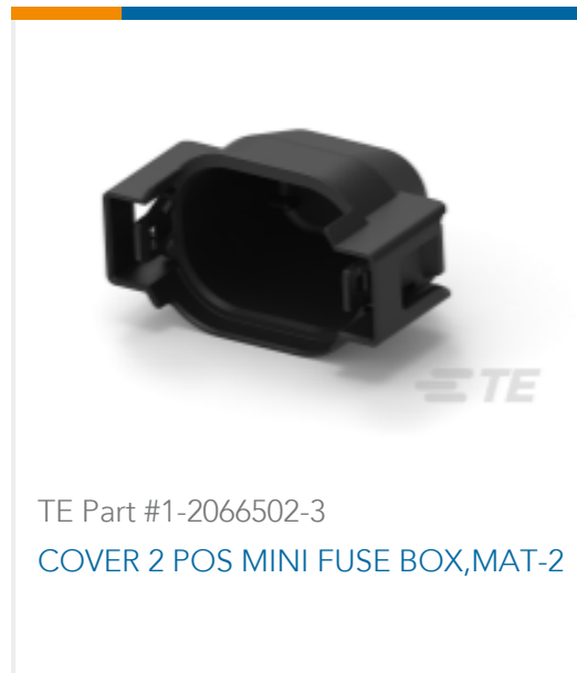
TE Part #1-2066502-3 COVER 2 POS MINI FUSE BOX,MAT-2