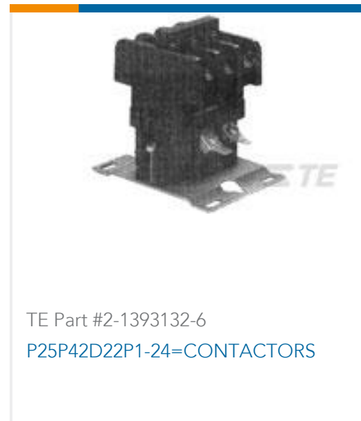
TE Part #2-1393132-6 P25P42D22P1-24=CONTACTORS