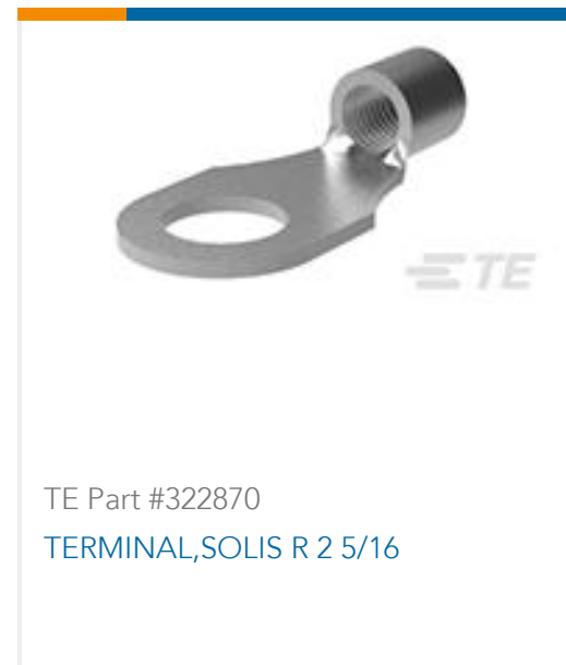
TE Part #322870 TERMINAL,SOLIS R 2 5/16