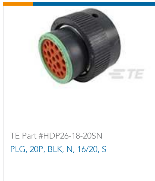
TE Part #HDP26-18-20SN PLG, 20P, BLK, N, 16/20, S