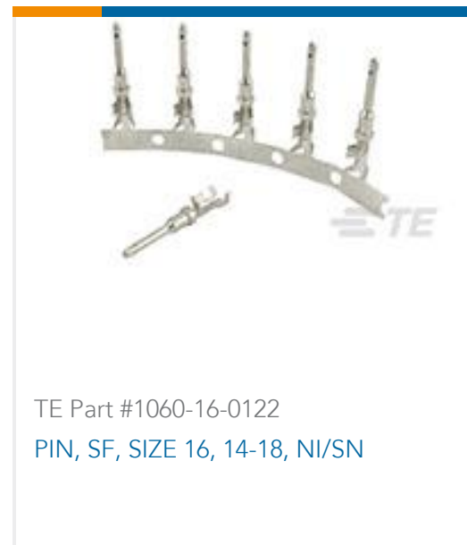
TE Part #1060-16-0122 PIN, SF, SIZE 16, 14-18, NI/SN