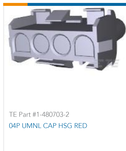
TE Part #1-480703-2 04P UMNL CAP HSG RED