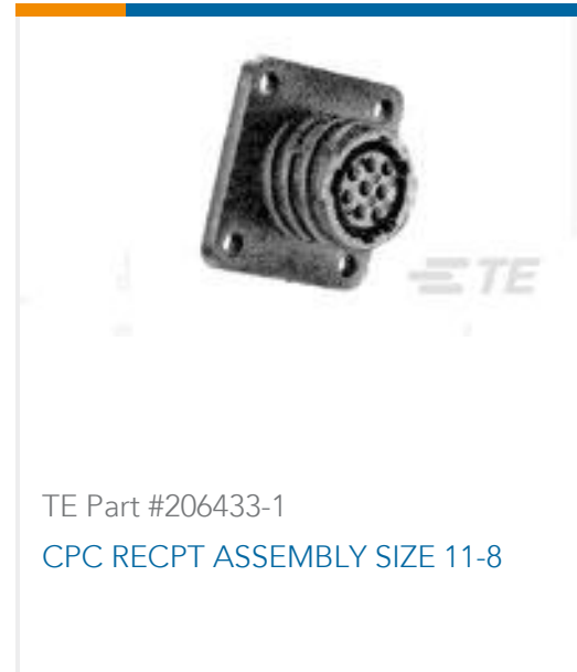
TE Part #206433-1 CPC RECPT ASSEMBLY SIZE 11-8