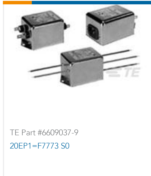
TE Part #6609037-9 20EP1=F7773 S0