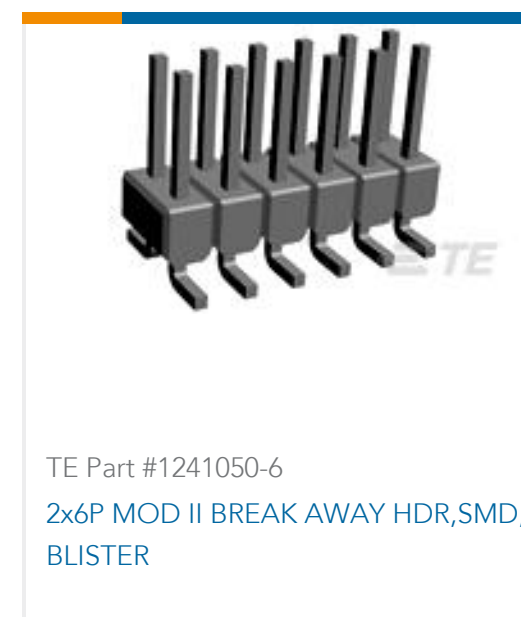
TE Part #1241050-6 2x6P MOD II BREAK AWAY HDR,SMD, BLISTER