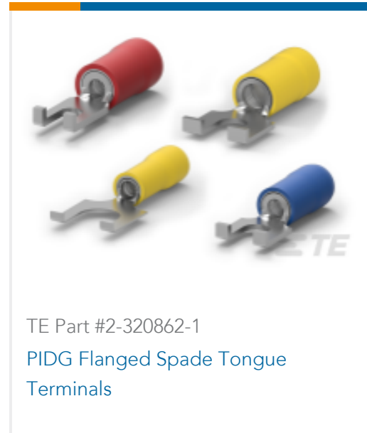
TE Part #2-320862-1 PIDG Flanged Spade Tongue Terminals