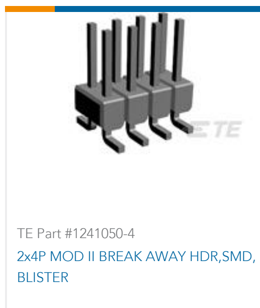
TE Part #1241050-4 2x4P MOD II BREAK AWAY HDR,SMD, BLISTER