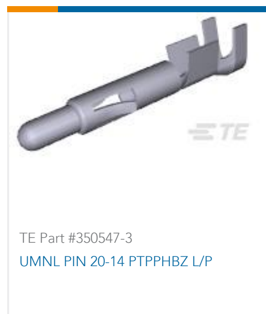
TE Part #350547-3 UMNL PIN 20-14 PTPPHBZ L/P