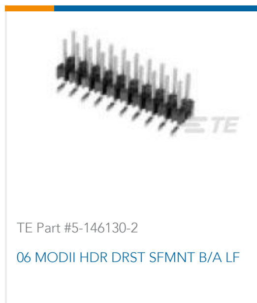
TE Part #5-146130-2 06 MODII HDR DRST SFMNT B/A LF