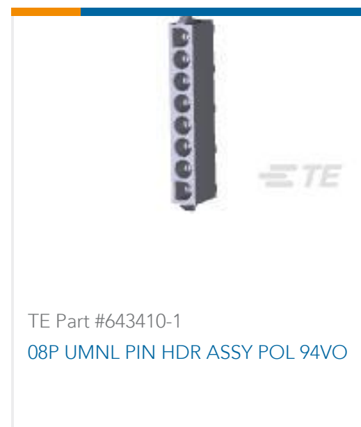
TE Part #643410-1 08P UMNL PIN HDR ASSY POL 94VO