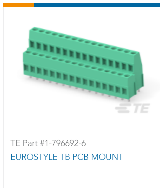
TE Part #1-796692-6 EUROSTYLE TB PCB MOUNT