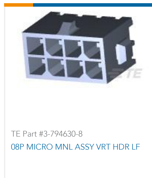
TE Part #3-794630-8 08P MICRO MNL ASSY VRT HDR LF