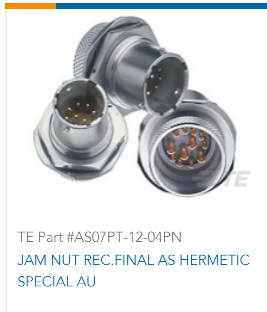
TE Part #AS07PT-12-04PN JAM NUT REC.FINAL AS HERMETIC SPECIAL AU