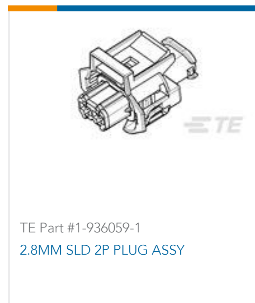
TE Part #1-936059-1 2.8MM SLD 2P PLUG ASSY