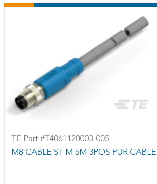
TE Part #T4061120003-005 M8 CABLE ST M 5M 3POS PUR CABLE