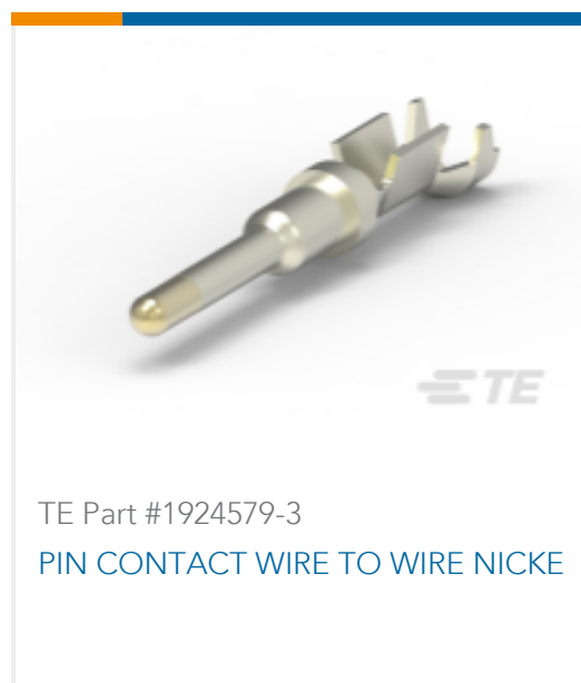
TE Part #1924579-3 PIN CONTACT WIRE TO WIRE NICKE