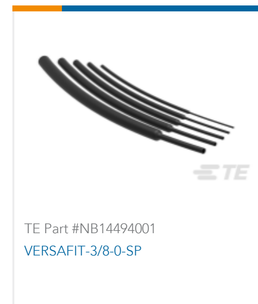
TE Part #NB14494001 VERSAFIT-3/8-0-SP