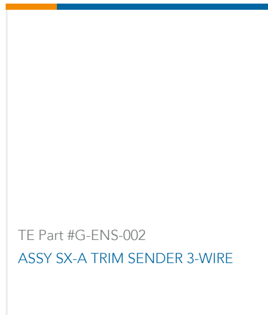
TE Part #G-ENS-002 ASSY SX-A TRIM SENDER 3-WIRE