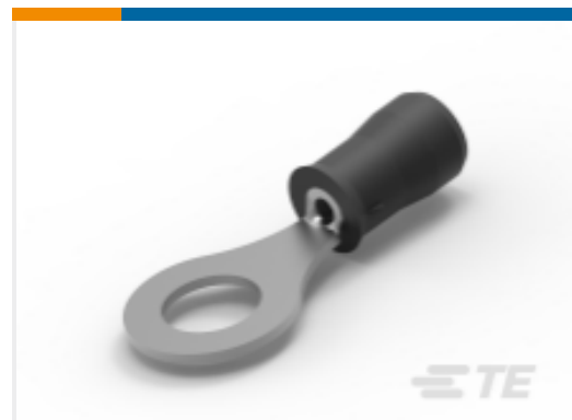
TE Part #324918 PIDG Ring Tongue Terminals