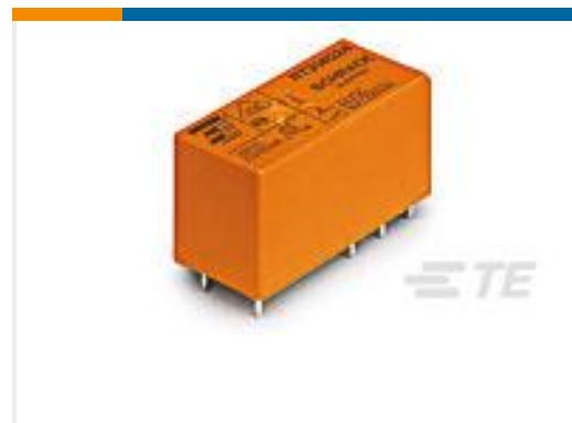
TE Part #6-1393238-8 RTD14024