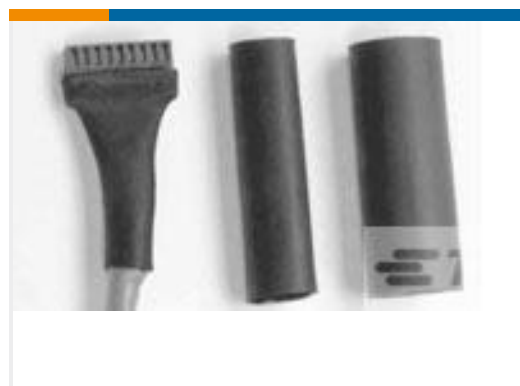
TE Part #2951512003 DWP-125-1/4-0-STK