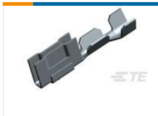
TE Part #1445336-1 LOOSE PC CONTACT TIN PLATED