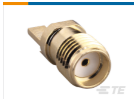
TE Part #L9000280-01 SMA Jack 50 Ohm .062 PCB Edge Mount