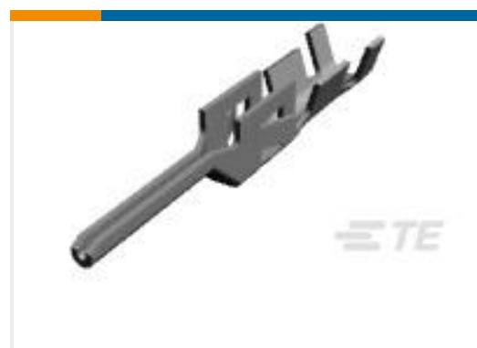
TE Part #1-794612-1 PIN CONT 20-24 15 GOLD L/P