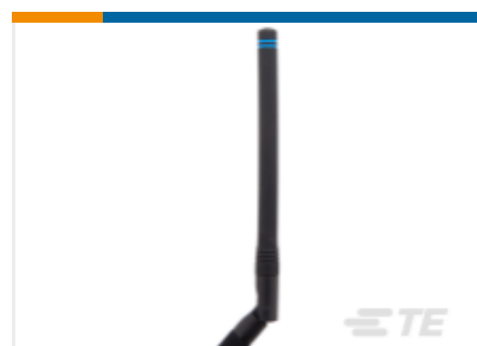
TE Part #ANT-418-CW-HWR-SMA Antenna 1/4 Wave Whip Swivel 418MHz SMA