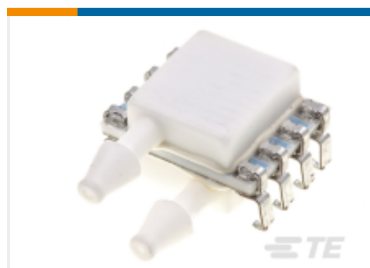
TE Part #4525DO-DS5AI001DP 1IN PCB MOUNT I2C DIFF PRESSURE SENSOR