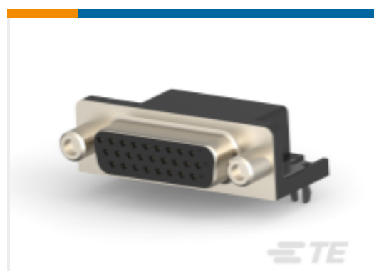
TE Part #2311768-2 AMPL REC, HD22, R/A, 26P, S/L