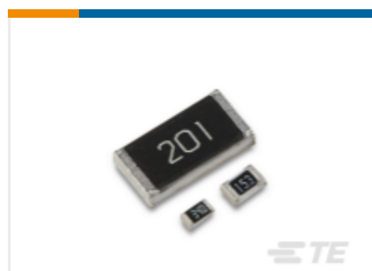
TE Part #4-2176326-6 CRGP 0603 56K 1%