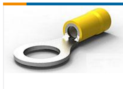
TE Part #34173 TERMINAL,PG R 12-10 3/8