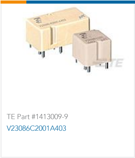
TE Part #1413009-9 V23086C2001A403