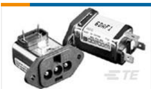
TE Part #2-6609075-5 10DAS1=F7987