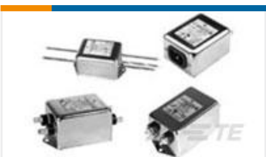
TE Part #1-6609031-7 20ER1=F7193 S0