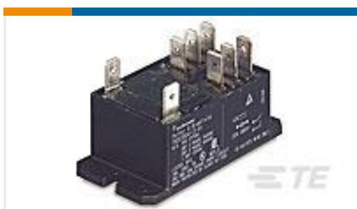
TE Part #3-1393211-8 T92P11A12-120