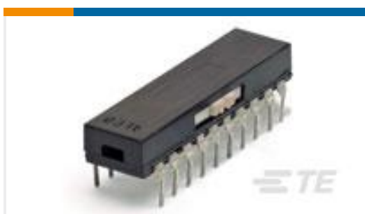
TE Part #2-1825011-1 ASF4204=4PDT AUTOSLIDE