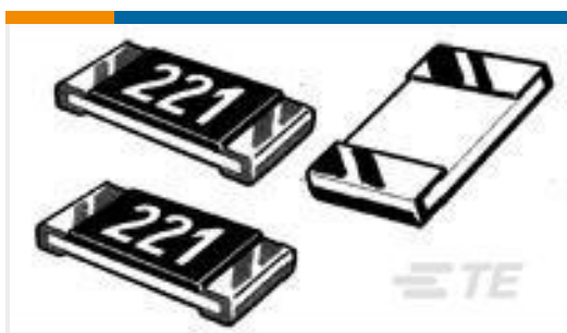
TE Part #7-2176070-7 3521 15K 1% 2W