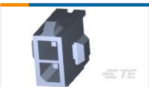
TE Part #3-794630-2 02P MICRO MNL ASSY,VRT,HDR,LF