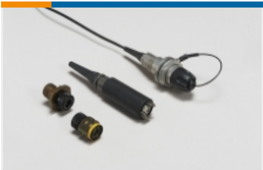
Expanded Beam Fiber Optics(9)