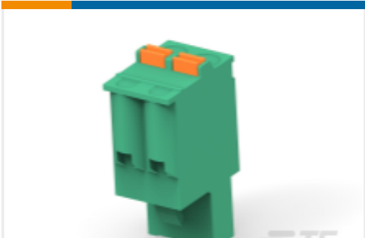
TE Part #2350397-2 2 POS SPRING TB PLUG, PITCH 5.00