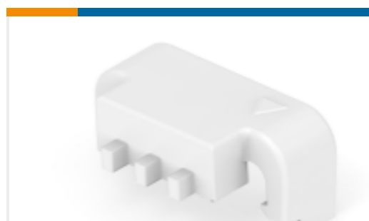
TE Part #119983-E IBRCMP RET 04 VE 208 BAG J 3 119980 IBRI