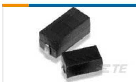
TE Part #4-1879233-5 SMW5 6R8 5%