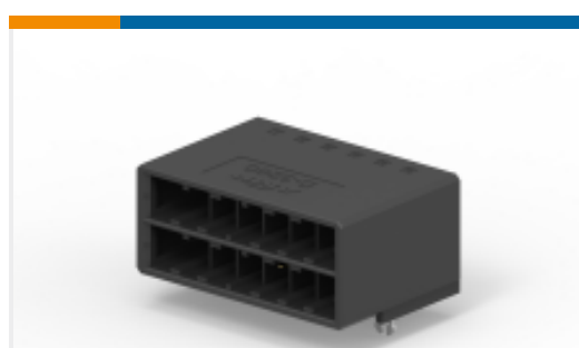
TE Part #1-2299005-1 DYNAMIC D3200M FMLB HDR ASSY 12P RR