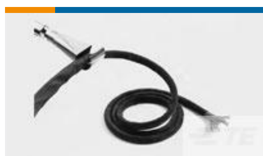
TE Part #CB7766-000 RW-200-1-0-SP