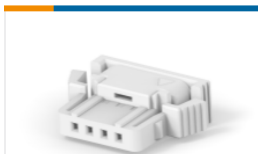
TE Part #119973-E IBRFHG VE 04 CSI 208 BAG J 3 119979 IBRI