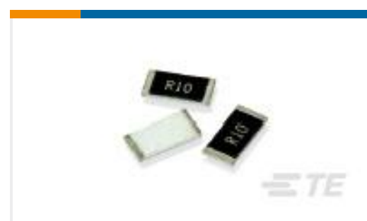
TE Part #3-2176057-4 RLP73K 3A R24 1% 1K RL