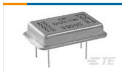
TE Part #1-1617069-0 DS9-1W=DS9 DIP SOLID STATE RELAY