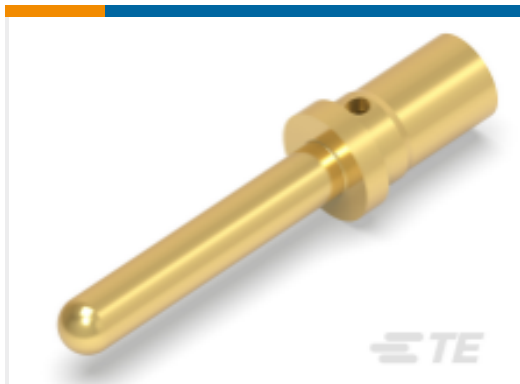
TE Part #1650153-2 701-12-02109=CONTACT,PIN,#12