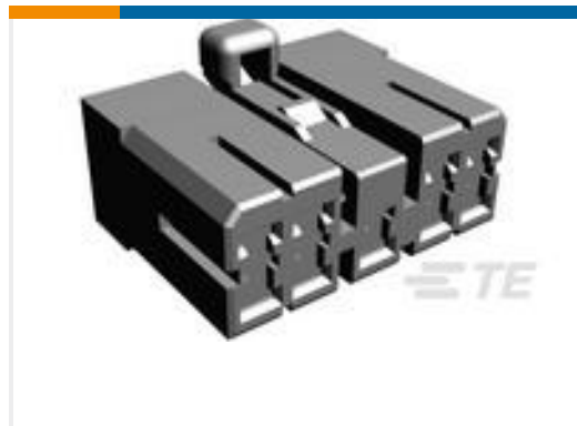
TE Part #172496-1 MIC PLUG HSG 9P (MK II)