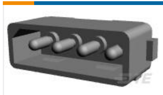
TE Part #1586515-2 04P CMNL HDR ASSY PC UL94 LF