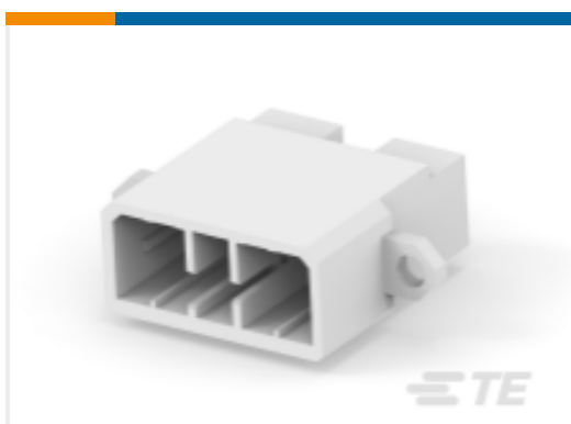
TE Part #172513-1 M.I.C. MARK II 9P CAP W/F