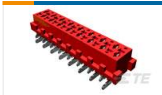
TE Part #8-188275-4 MICRO-MATCH SMD FTE