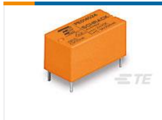
TE Part #5-1415534-9 PE015005