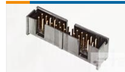
TE Part #5103309-1 A/L LOW PRO HDR 10P VERT BLACK