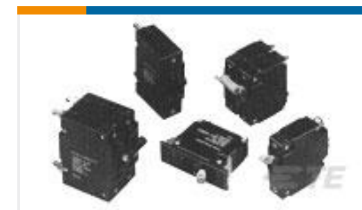
TE Part #6-1393254-4 W92-X1110-30=M6/M7/M9/W6/W7