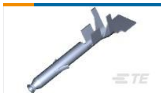
TE Part #770904-3 MINI UMNL SOK 22-18 AWG AU