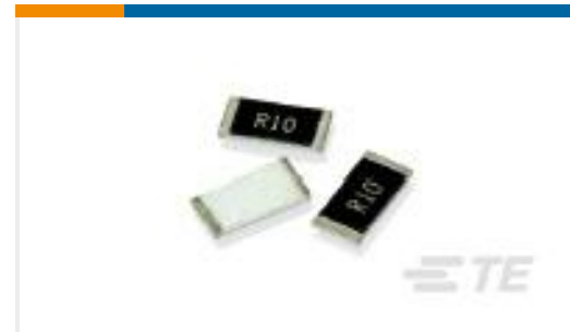
TE Part #2176050-1 RLP73M 1E R051 5% 5K RL