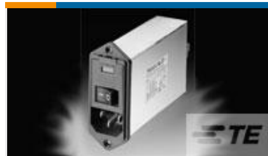
TE Part #3-1609109-3 PM0S0DZXC=C7081