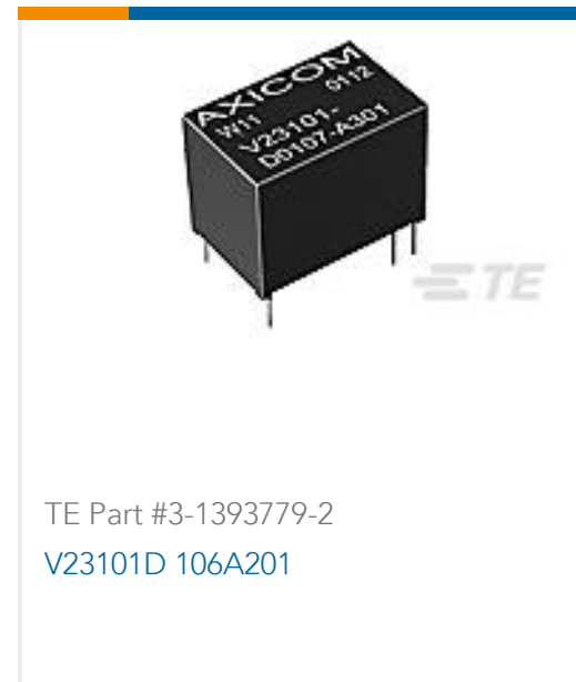
TE Part #3-1393779-2 V23101D 106A201