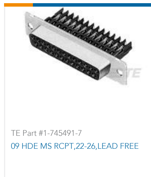
TE Part #1-745491-7 09 HDE MS RCPT,22-26,LEAD FREE