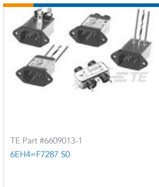
TE Part #6609013-1 6EH4=F7287 S0