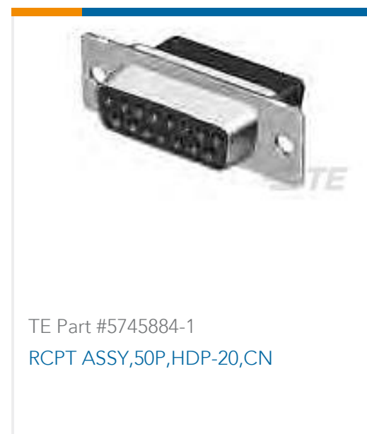
TE Part #5745884-1 RCPT ASSY,50P,HDP-20,CN