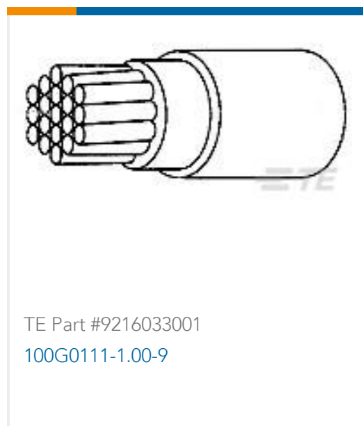
TE Part #9216033001 100G0111-1.00-9