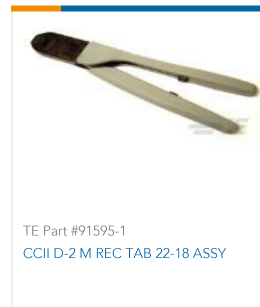
TE Part #91595-1 CCII D-2 M REC TAB 22-18 ASSY