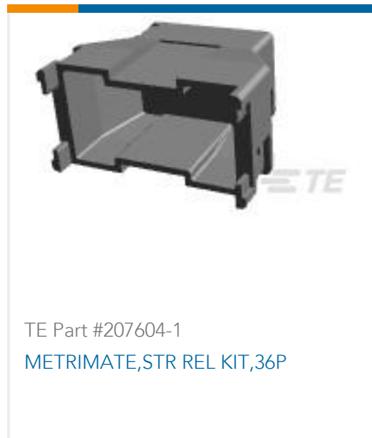
TE Part #207604-1 METRIMATE,STR REL KIT,36P