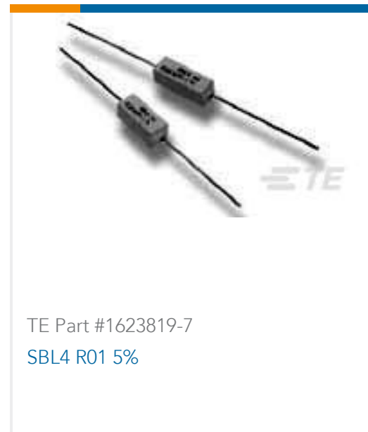
TE Part #1623819-7 SBL4 R01 5%