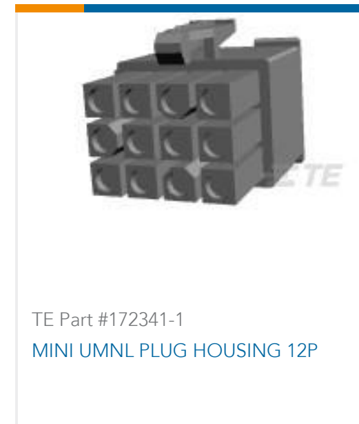
TE Part #172341-1 MINI UMNL PLUG HOUSING 12P