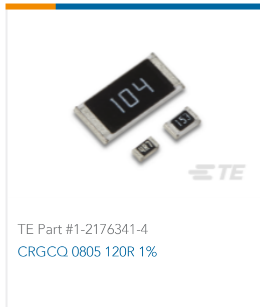
TE Part #1-2176341-4 CRGCO 0805 120R 1%