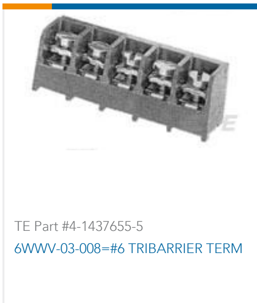
TE Part #4-1437655-5 6WWV-03-008=#6 TRIBARRIER TERM