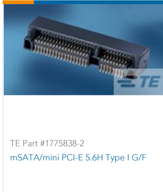
TE Part #1775838-2 mSATA/mini PCI-E 5.6H Type I G/F