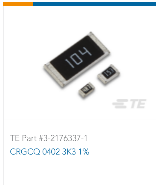
TE Part #3-2176337-1 CRGCO 0402 3K3 1%