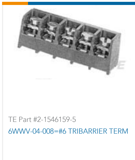
TE Part #2-1546159-5 6WWV-04-008=#6 TRIBARRIER TERM