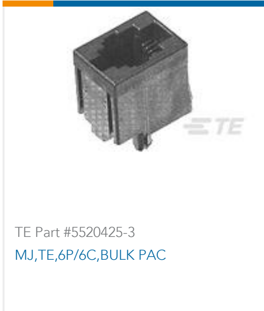
TE Part #5520425-3 MJ,TE,6P/6C,BULK PAC