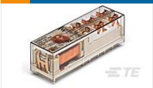
TE Part #9-1415018-1 SR6A4110 - V23050-A1110-A533