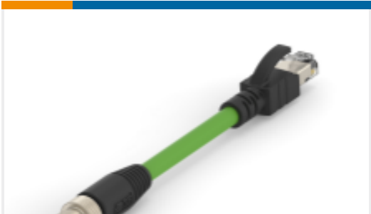
TE Part #TCX38721112-004 RPC-M12X-8MS-3.0SH-RJ45-8MS-PVC