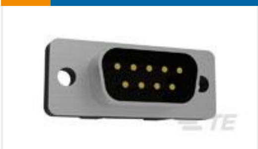
TE Part #1658613-4 09 POS HDF PLUG, MS, LEAD FREE