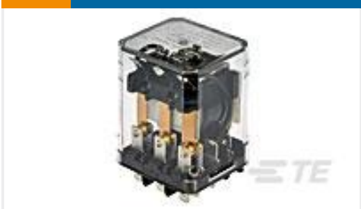
TE Part #8-1393117-7 KUP-14A35-120=KU