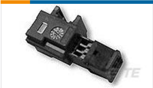
TE Part #1379118-4 6POS MQS TAB