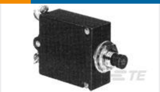
TE Part #7-1393246-4 W23-X1A1G-40=W23/W31