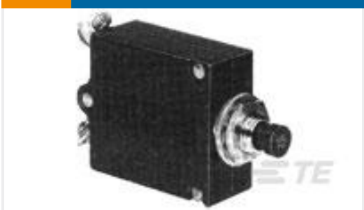
TE Part #6-1393246-5 W23-X1A1G-10=W23/W31