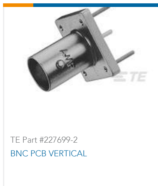
TE Part #227699-2 BNC PCB VERTICAL