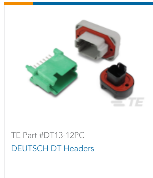
TE Part #DT13-12PC DEUTSCH DT Headers