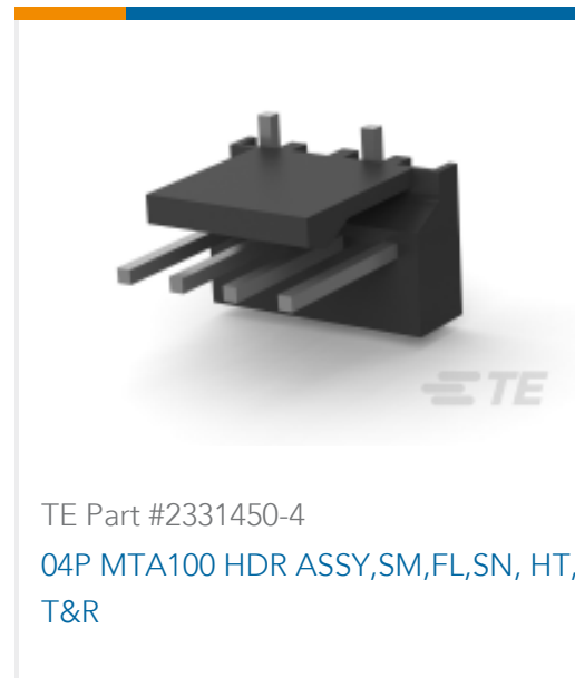
TE Part #2331450-4 04P MTA100 HDR ASSY,SM,FL,SN, HT, T&R