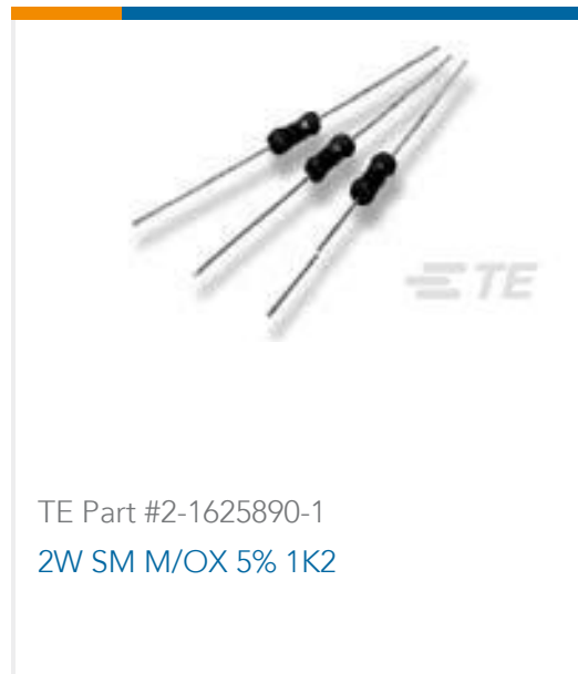
TE Part #2-1625890-1 2W SM M/OX 5% 1K2