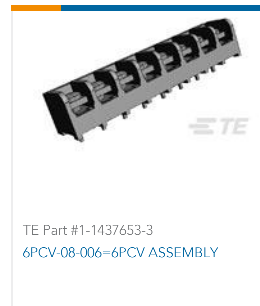
TE Part #1-1437653-3 6PCV-08-006=6PCV ASSEMBLY BLISTER