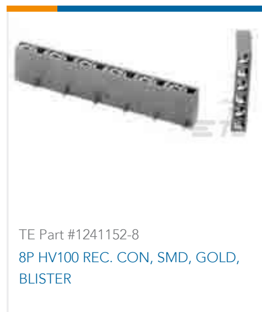
TE Part #1241152-8 8P HV100 REC. CON, SMD, GOLD, BLISTER