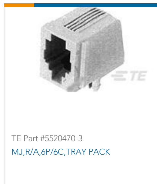
TE Part #5520470-3 MJ,R/A,6P/6C,TRAY PACK