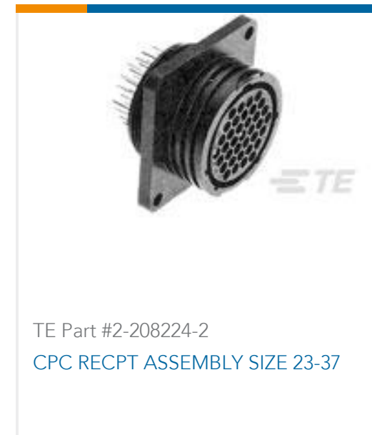
TE Part #2-208224-2 CPC RECPT ASSEMBLY SIZE 23-37