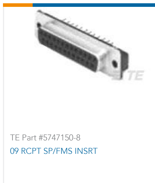
TE Part #5747150-8 09 RCPT SP/FMS INSRT