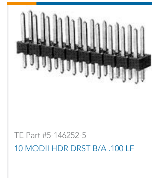
TE Part #5-146252-5 10 MODII HDR DRST B/A .100 LF