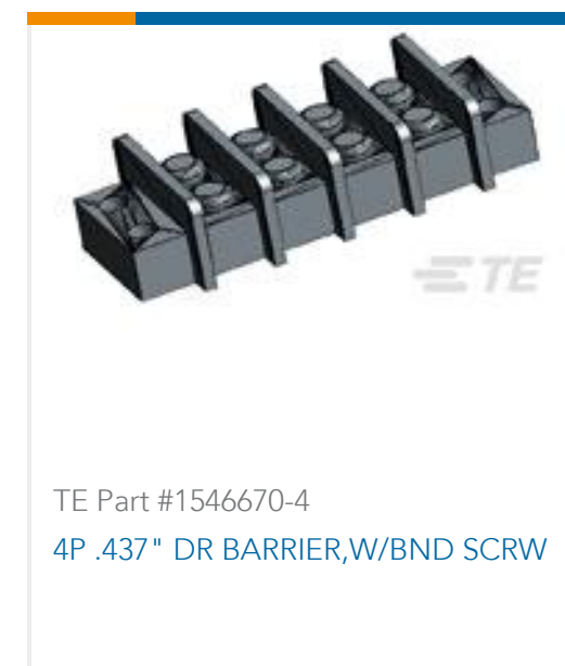
TE Part #1546670-4 4P .437" DR BARRIER,W/BND SCRW