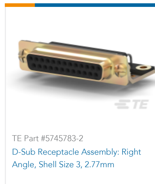
TE Part #5745783-2 D-Sub Receptacle Assembly: Right Angle, Shell Size 3, 2.77mm