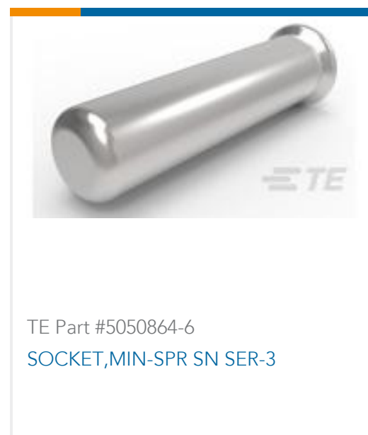
TE Part #5050864-6 SOCKET,MIN-SPR SN SER-3