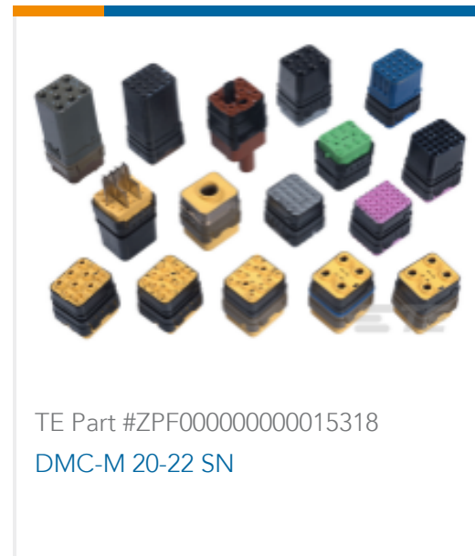
TE Part #ZPF000000000015318 DMC-M 20-22 SN