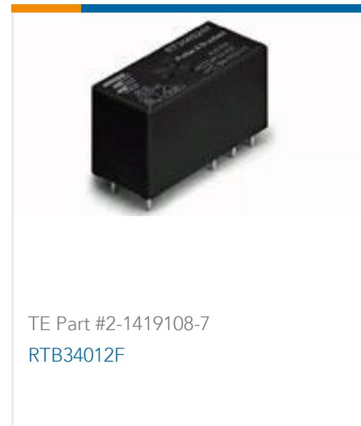
TE Part #2-1419108-7 RTB34012F