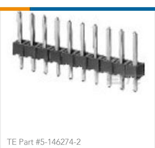
1E Part #5-1462/4-2 02 MODII HDR SRST B/A .100CL