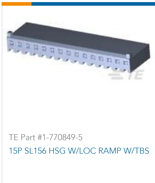
TE Part #1-770849-5 15P SL156 HSG W/LOC RAMP W/TBS