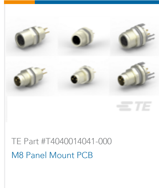
TE Part #T4040014041-000 M8 Panel Mount PCB