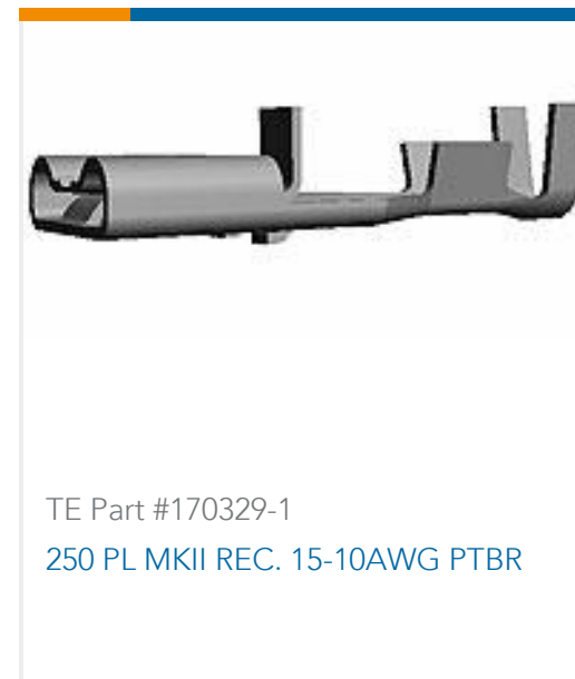
TE Part #170329-1 250 PL MKII REC. 15-10AWG PTBR