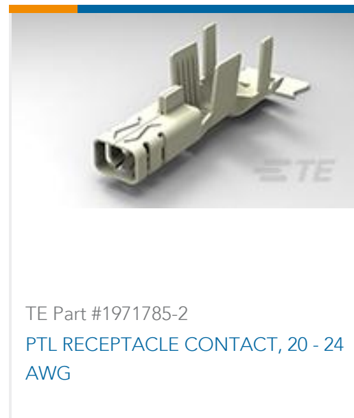
TE Part #1971785-2 PTL RECEPTACLE CONTACT, 20 - 24 AWG