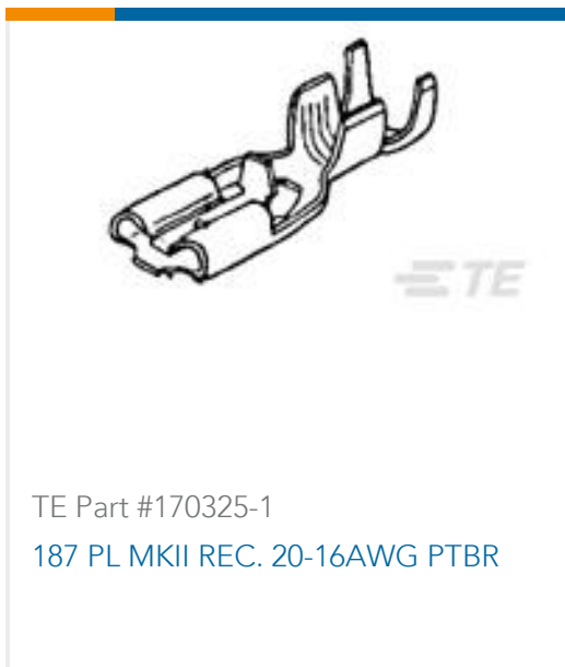
TE Part #170325-1 187 PL MKII REC. 20-16AWG PTBR