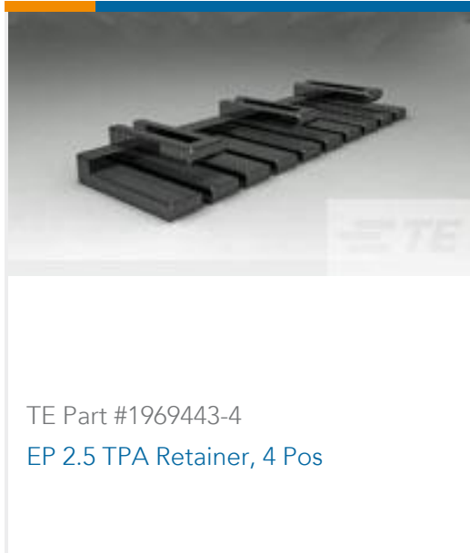
TE Part #1969443-4 EP 2.5 TPA Retainer, 4 Pos