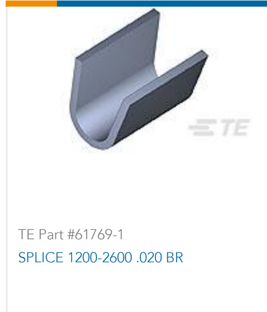
TE Part #61769-1 SPLICE 1200-2600 .020 BR