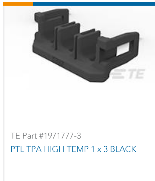
TE Part #1971777-3 PTL TPA HIGH TEMP 1 x 3 BLACK