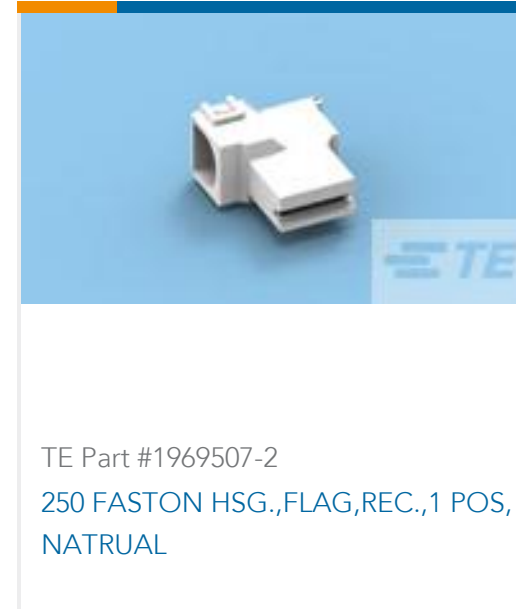
TE Part #1969507-2 250 FASTON HSG, FLAG, REC., 1 POS, NATURAL